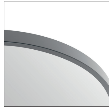
OP opal diffusor